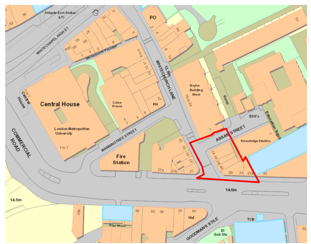
Figure 1: Site location plan