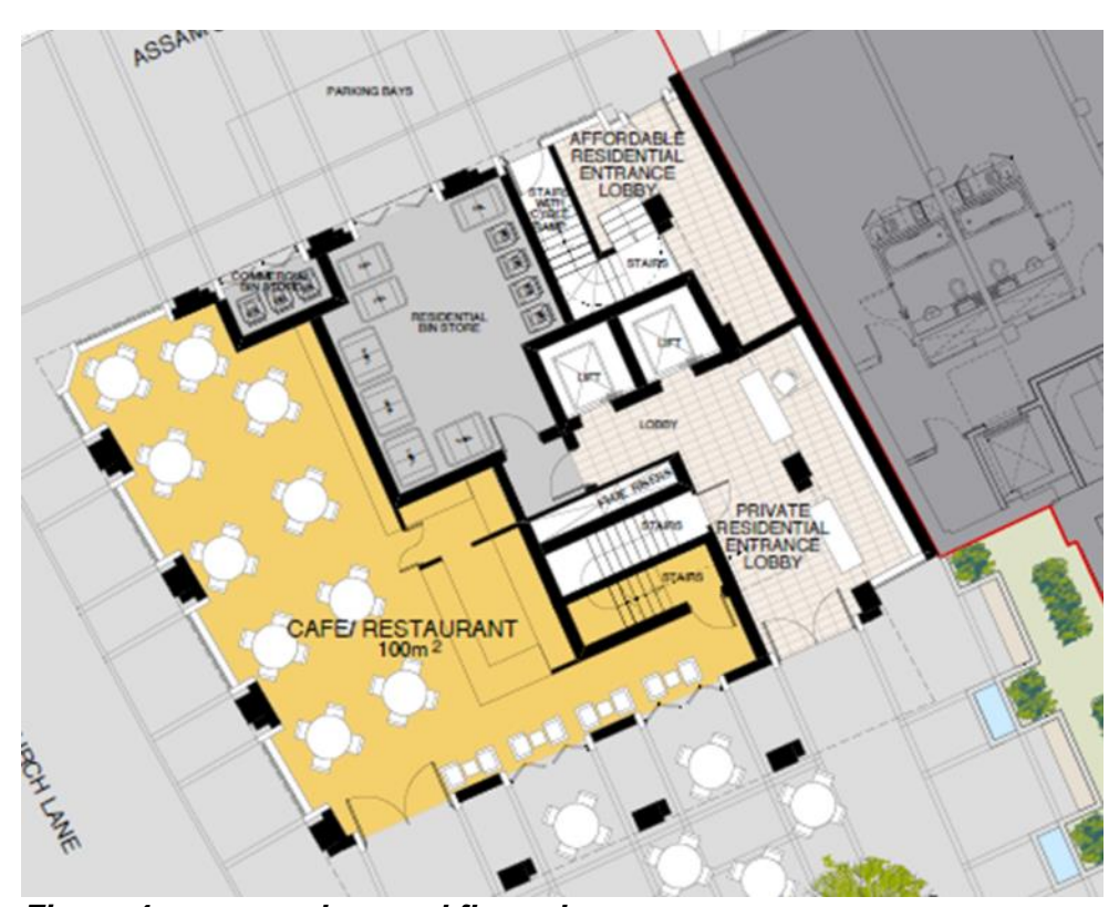
Figure 4: proposed ground floor plan

4.11 The scheme would create a small new public realm space at the junction of Commercial Road and White Church Lane that would be finished (through a mix of hard and soft