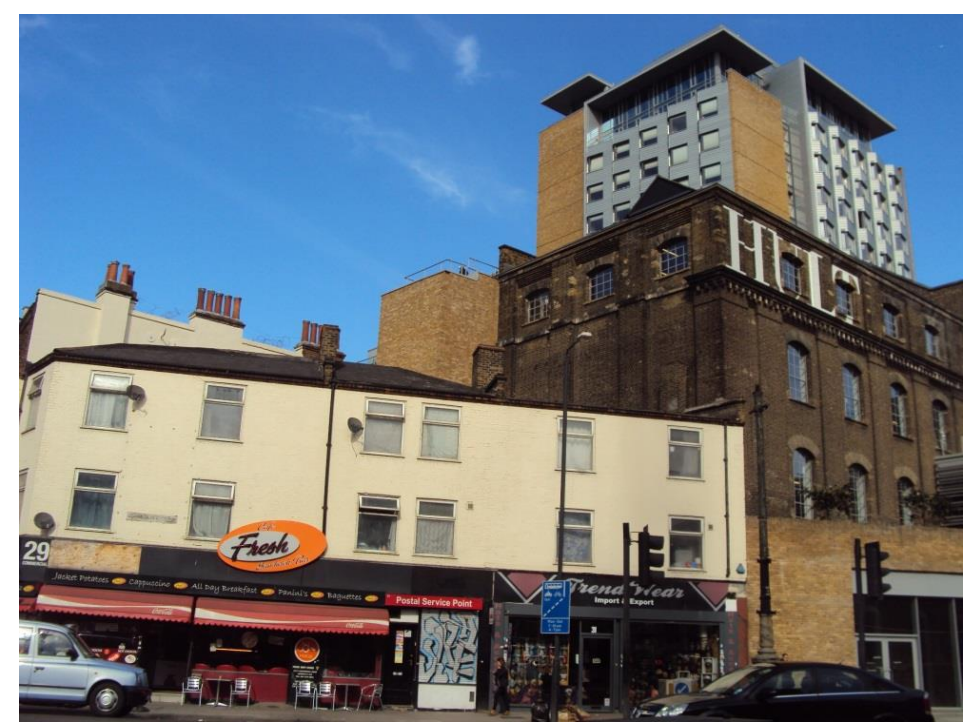
Figure 2: No. 29-31 Commercial Road (with listed former St George's Brewery Road right hand side of photo and the student block at No. 35 Commercial Road set behind warehouse)