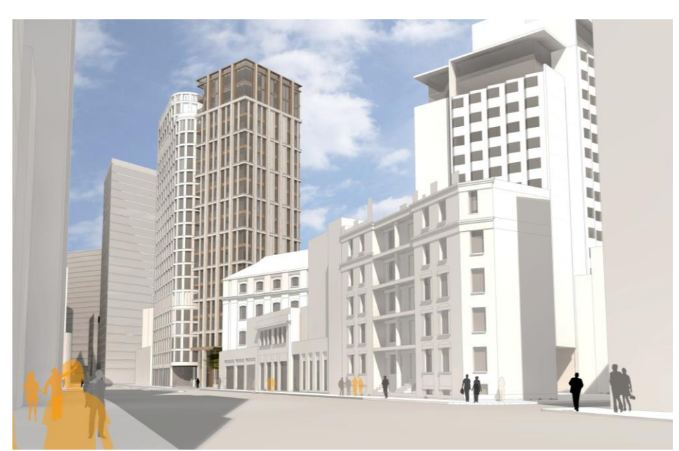
Figure 5: CGI image of scheme looking west along Commercial road (with No 35 Commercial Road in right of image and the consented serviced apartment scheme at No 27 Commercial Road set beyond the proposed scheme

9.37 The northern end of White Church Lane is located in the Whitechapel High Street Conservation Area and it would form part of the backdrop of Altab Ali Park, an important area of open space in the Conservation Area. Again, special importance to the impacts on the setting of the Conervation Area has been applied in the balancing exercise. Aldgate is identified as a location for tall buildings. There are a number of existing consented schemes for tall buildings set to the south of Altab Ali Park and having particular regard to the verified views within the submitted Visual Impact Assessment, the impact on the views and settings of nearby listed buildings, conservation areas and the Altab Ali Park in particular are considered to be acceptable neutral/minor adverse impacts outweighed by the public benefits of the scheme in terms of delivery of new homes to high amenity and the public realm benefits including an improved setting to the at the base of the adjacent grade II listed warehouse.